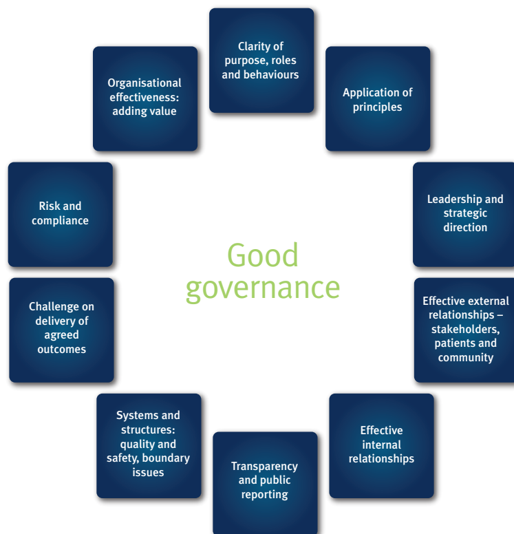
Figure 1. The 10 governance themes

We have attempted to support the concept of subsidiarity, which implies the pushing down of control and responsibility as near to the coalface as possible. We have described for each of these themes the practical application of each principle at board/governing body, division and department level within a healthcare provider organisation. To help flesh this out further, we have included example assurance questions for each of the themes that might be asked, and an accompanying good and weak answer to these. This follows the model used in other GGI support materials such as the series of Board Assurance Prompts (BAPs). 6